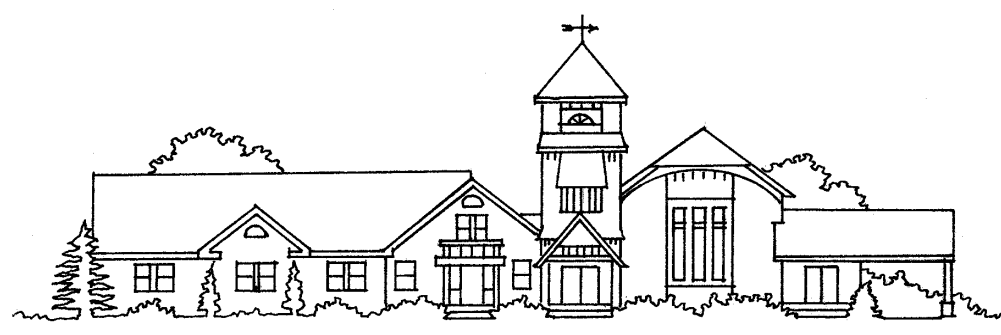
Faithfully Friendly For All – Always Welcome . Include . Involve